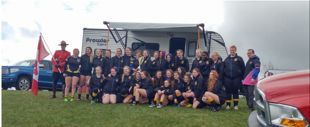
Amazons - Won Gold